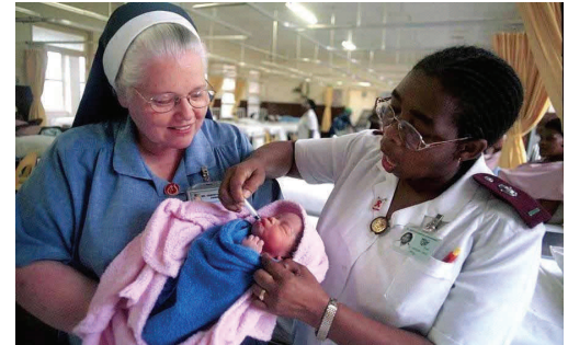
Many CCIH members are involved in HIV/AIDS programming, such as this program to Prevent Mother-to-Child Transmission of HIV run by Catholic Medical Mission Board (CMMB).