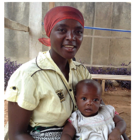
Bishop Masereka Medical Center provides immunizations in Kasese, Uganda.

All 59 respondents who answered the question agreed with the definition.