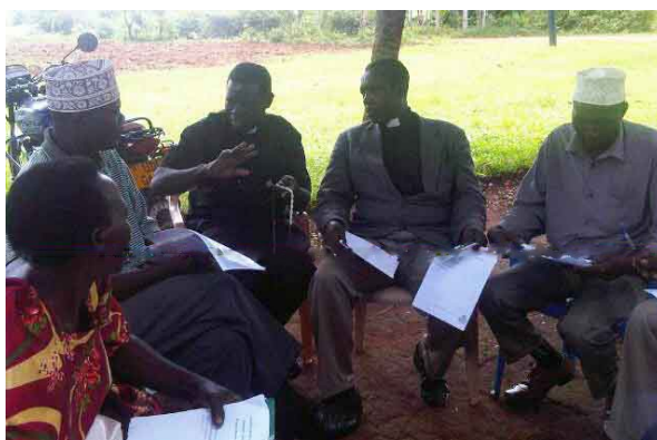
A Catholic priest discusses the Standard Days Method® of natural family planning with other religious leaders.

The story of Onan is often cited as evidence that God disapproves of contraception. Onan was instructed to have sexual relations with his brother’s widow for the purpose of producing an heir for his brother, as was customary at the time. Onan had relations with the widow, but used the withdrawal method to avoid a pregnancy, resulting in punishment by God. When viewed in its entirety, this story is about Onan’s selfishness and greed: his sin is using the widow for his own pleasure instead of helping his family, not because he used contraception.