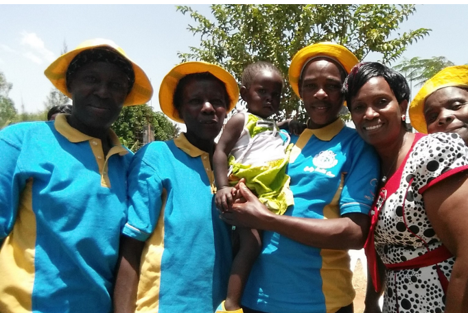
Community health volunteers, like these shown above, help families time and space pregnancies with support from the Christian Health Association of Kenya.

The lives of 1.6 million children could be saved each year if births were spaced three years apart. And, planning pregnancies prevents unintended pregnancies, which reduces abortions. Research published by the Center for Global Development reveals when people had access to modern contraceptives, abortions decreased.