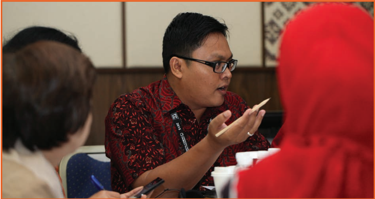
A section of participants from Indonesia, holds their group discussions