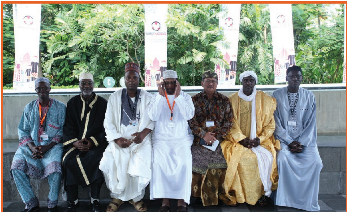
A section of participants in their religious and cultural attire