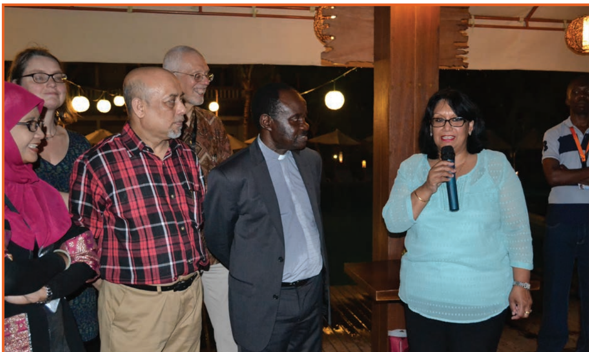
Baroness Verma, Parliamentary Under Secretary of State for International Development, addresses guests at the Faith Networking Reception at ICFP, as Steering Council members of the Faith to Action Network looks on.

The Anglican Church in Africa has a programme called Church community mobilisation programme which focuses on church congregations where they train facilitators who help to identify and mobilise the resources within the communities, especially local resources, to address various challenges including poverty alleviation, family planning and economic empowerment.