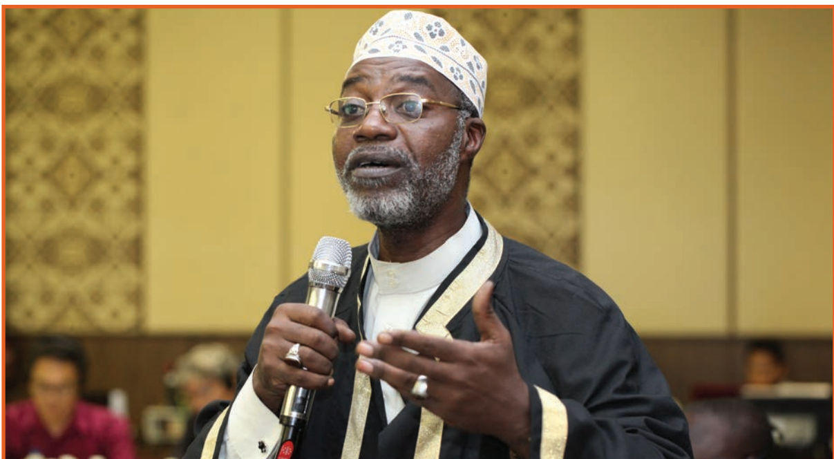
Sheikh Luaba Mangala, Grand Mufti, DRC and President, UMC / Islamic, Union Consuls of Central Eastern and Southern Africa leads prayer during the lunch break, Day one of the preconference.

Day 1 lunch Prayer was led by Grand Mufti, Sheikh Luaba Mangala, Grand Mufti – Democratic Republic of Congo (DRC) and President, Islamic Union Consuls of Central Eastern and Southern Africa (UMC).