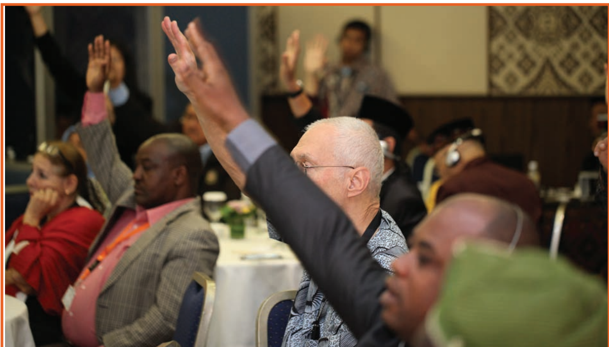
Participants contribute to the plenary discussions