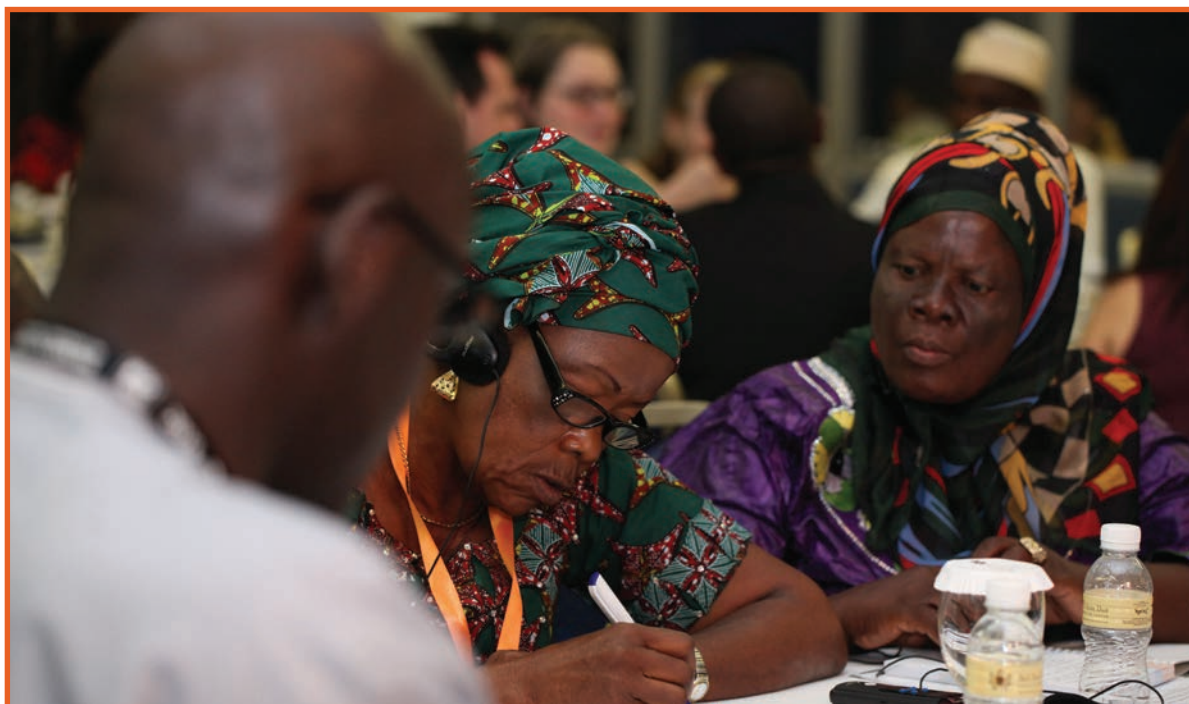
A section of french speaking participants during the group discussions