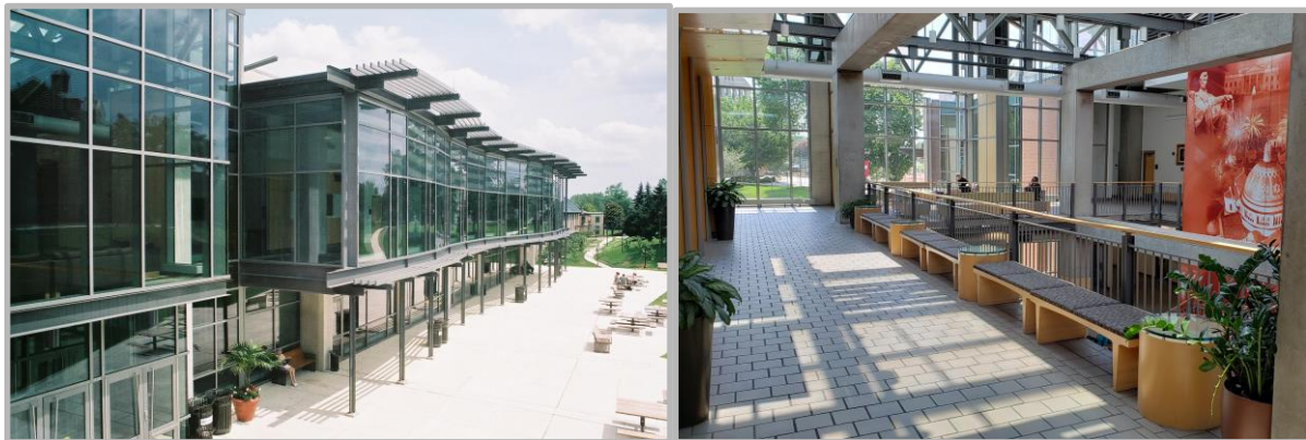
Pryzbyla Center offers plenty of open space for discussions and networking

We are relocating the conference to the Pryzbyla Center at Catholic University in Washington, DC. The University is on a metro stop for easy access, and the conference venue is larger than in previous years. Sponsor tables will be in open, public spaces to maximize traffic. We'll emphasize more time and creative opportunities for participant interaction.