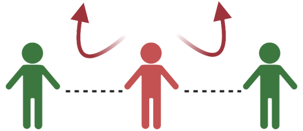
Khalani Motalikizana (osachepera 1 mita)