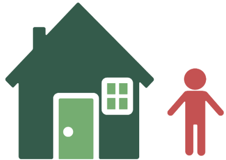
Tisayendeyende (Khalani pakhomo)