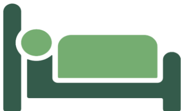
Khalani pakhomo ngati simukupeza bwino