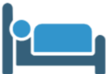
Rest at Home If a little Sick