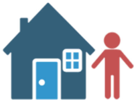
Don't Travel Far