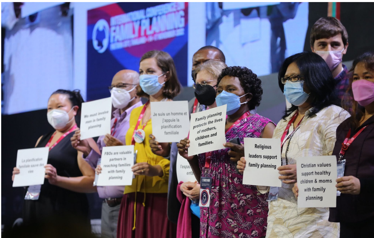
CCIH staff and members at the International Conference on Family Planning.