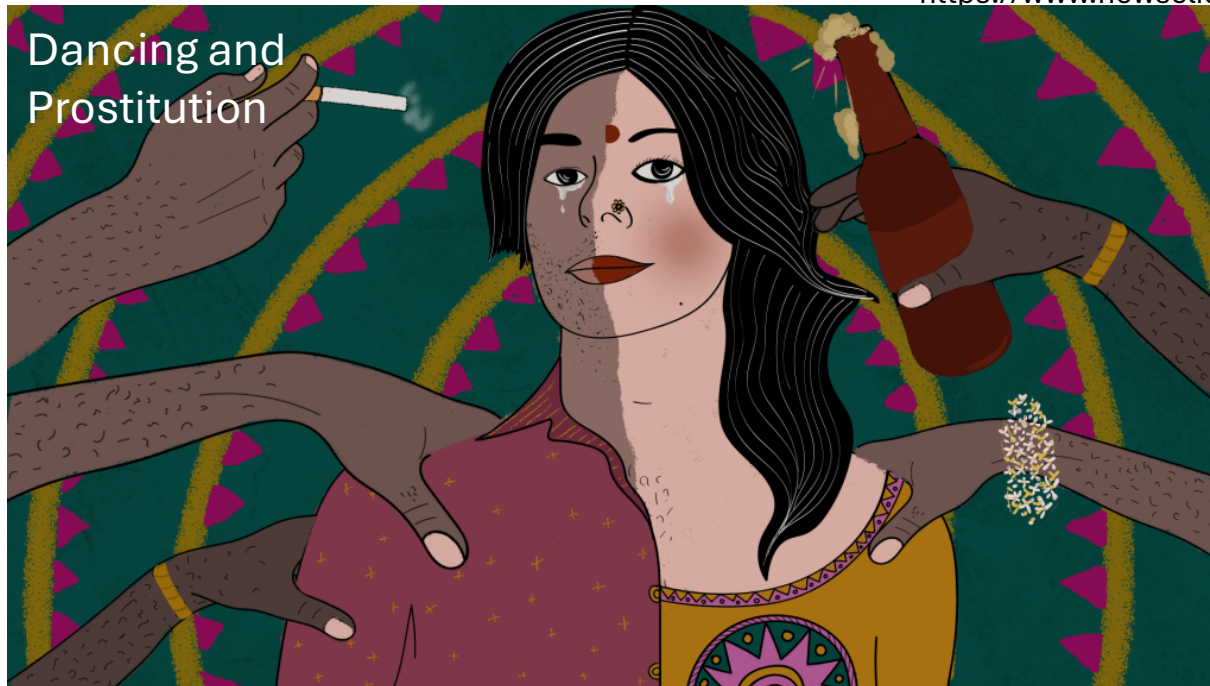
Dancing and Prostitution

https://www.vice.com/en/article/en/article/meet-the-launda-dancers/