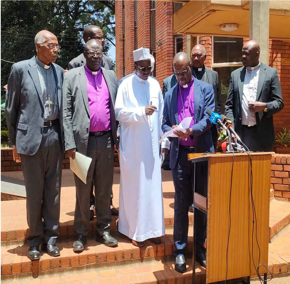
Religious Leaders Advocacy Media engagement on SHA at Ufungamano House