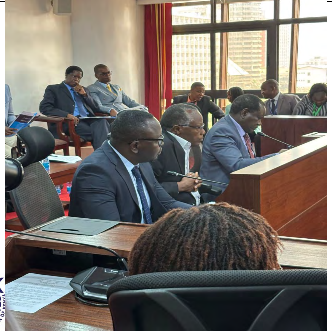
KFBHSC Meeting with Parliamentary Health Committee on PHC Budget & unpaid bills