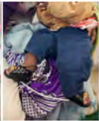
Foot abduction brace