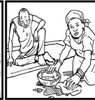
Wear gloves when caring for a sick person.