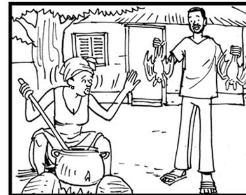
Don't eat bats or dead bush animals.