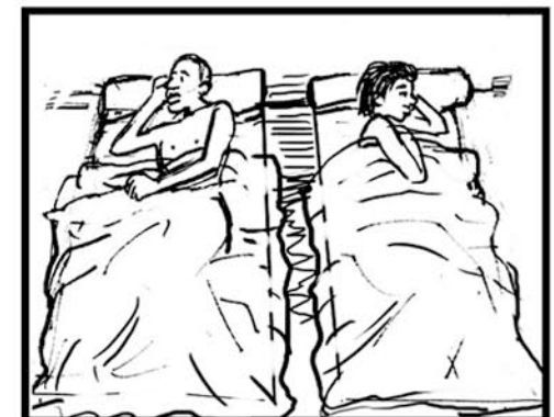
Don't have sex for 7 weeks after you have had Ebola.