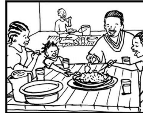
Don't share plates, spoons or cups with a sick person.