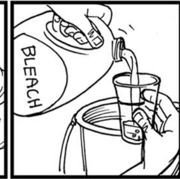
Clean up after a sick person using a half cup of bleach in water.