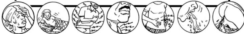
Sudden fever Weakness Body aches Sore throat Stomach ache Vomiting Diarrhea