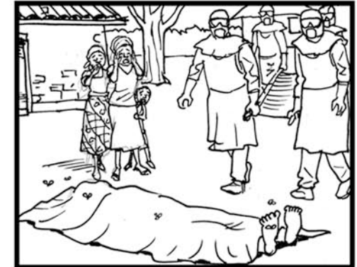
Don't touch the body of an Ebola victim without protective clothing.