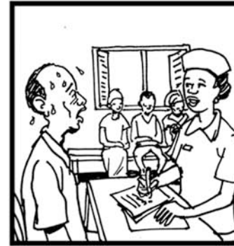
Go to the hospital immediately.